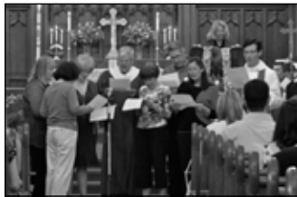
Reading the story in multiple languages

Today we may not have great winds or tongues of fire resting on our heads, but we do believe that the Holy Spirit is no less involved in our lives — guiding, comforting and empowering. We at St. Peter’s need the presence of the Holy Spirit just as much as those apostles did.